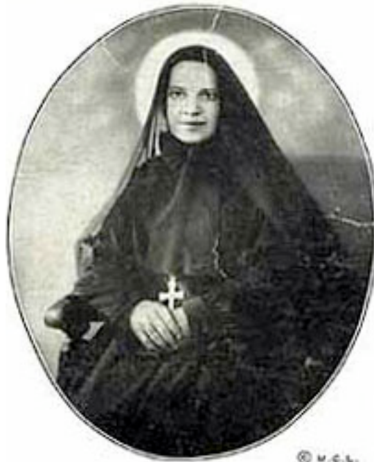
St. Frances Xavier Cabrini, Feast Day 11/13

Especially those in most need of Thy mercy.